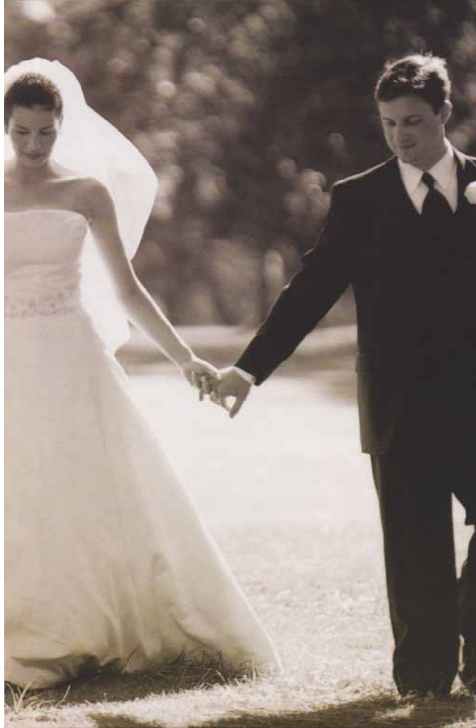
See ad on page 2

The process of planning a wedding can be full of details and take many months to perfect. And yet, many brides- and grooms-to-be still take the plunge, taking on the pleasure and sometimes pain of planning their own weddings. Many brides, grooms and mothers seem to dive in head-first, taking to the task with a real gung-ho, take-charge energy. However, in today's fast-paced world, many of us can be overcommitted with responsibilities such as full-time jobs, school, children and other activities even before starting to plan a wedding—which can easily be a full-time job in itself.